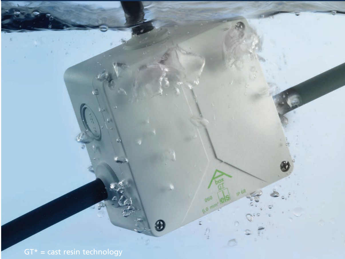
GT* = cast resin technology